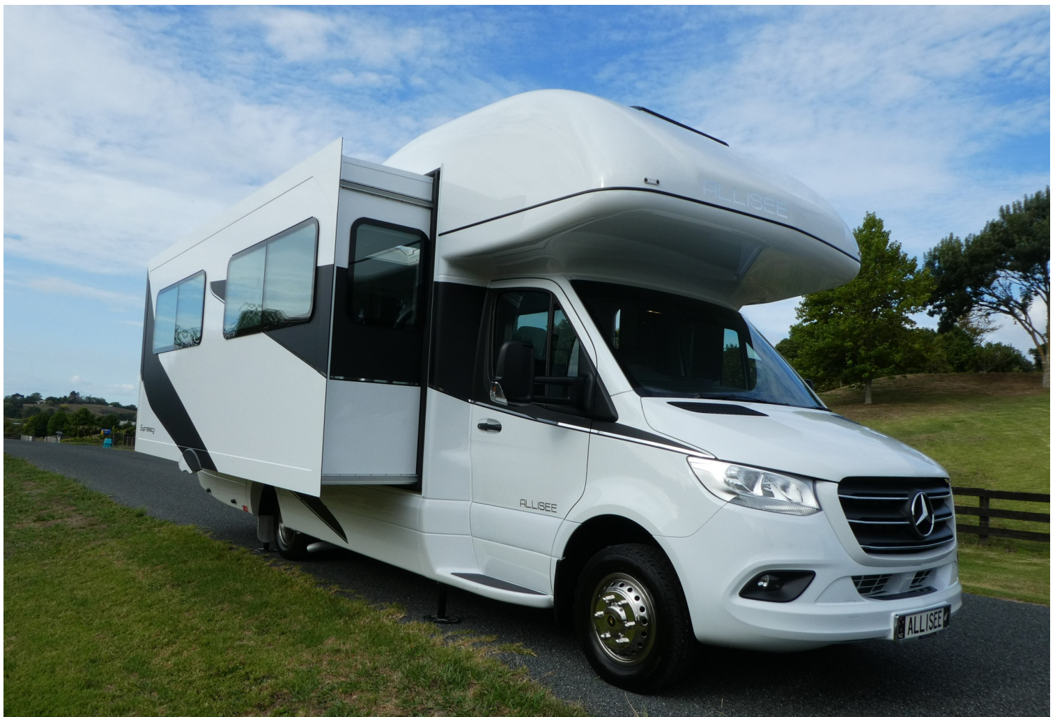
Full length slide-out on Mercedes 519 Sprinter Chassis