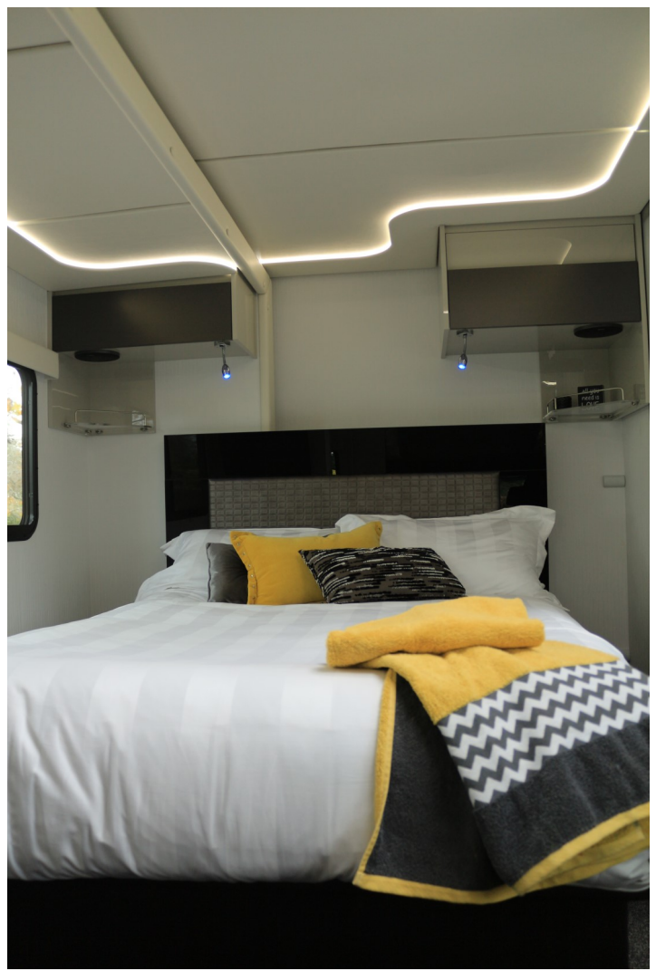
Full size walk island bed