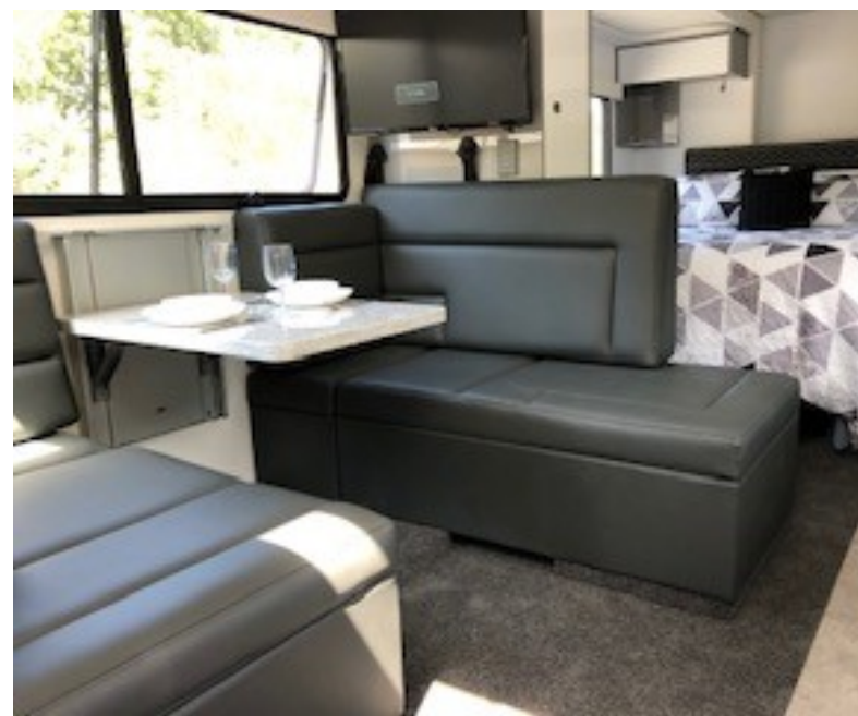
Modular Seating Area for convenience