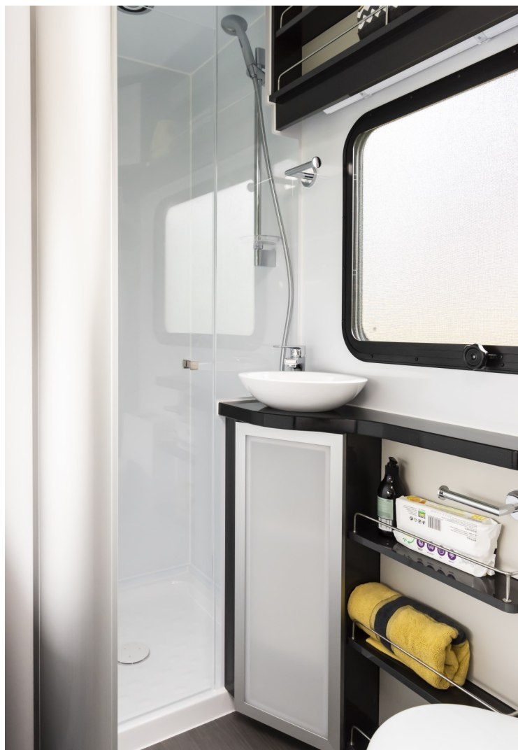
Full Bathroom with diesel hot water system