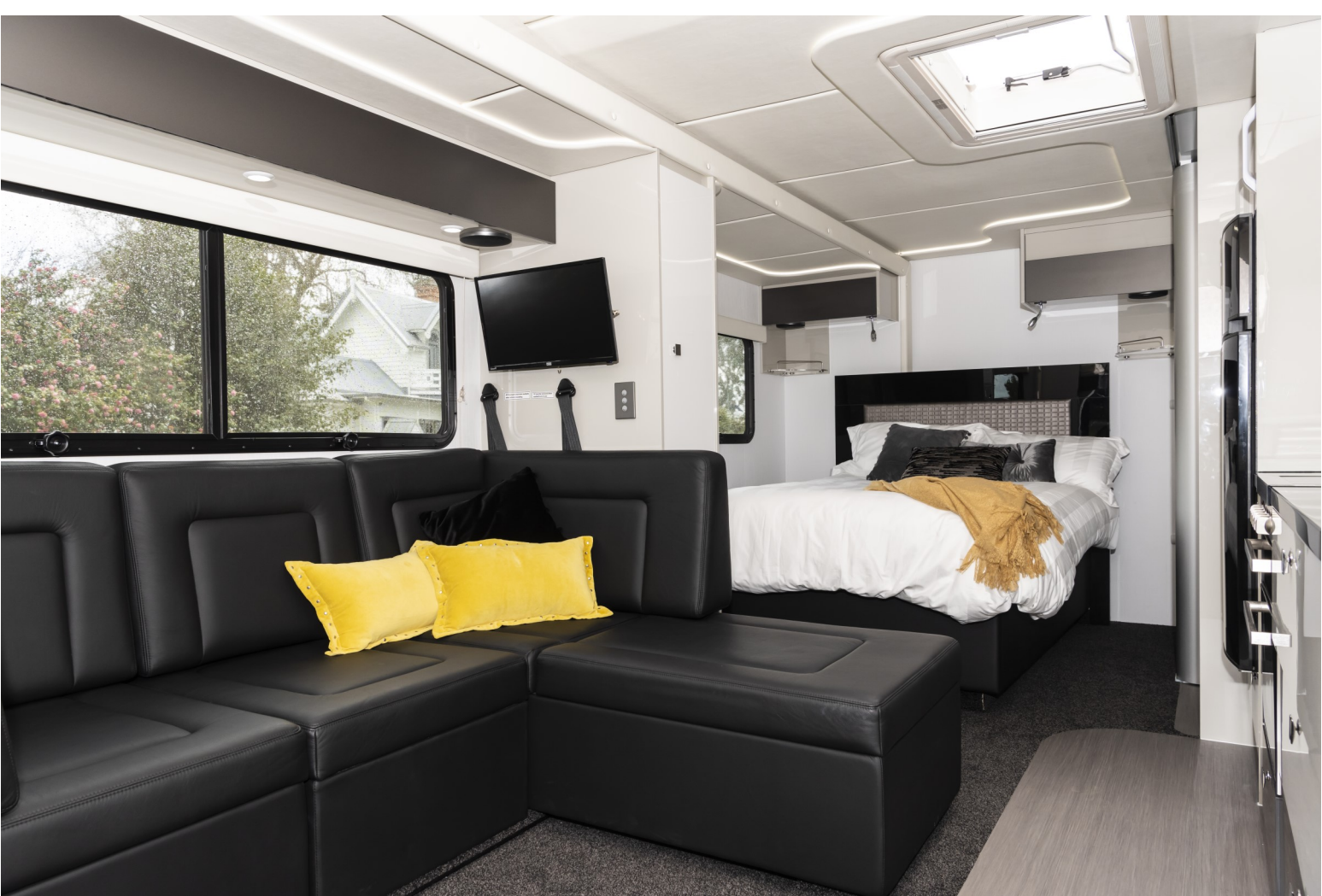
Large Spacious Living Area