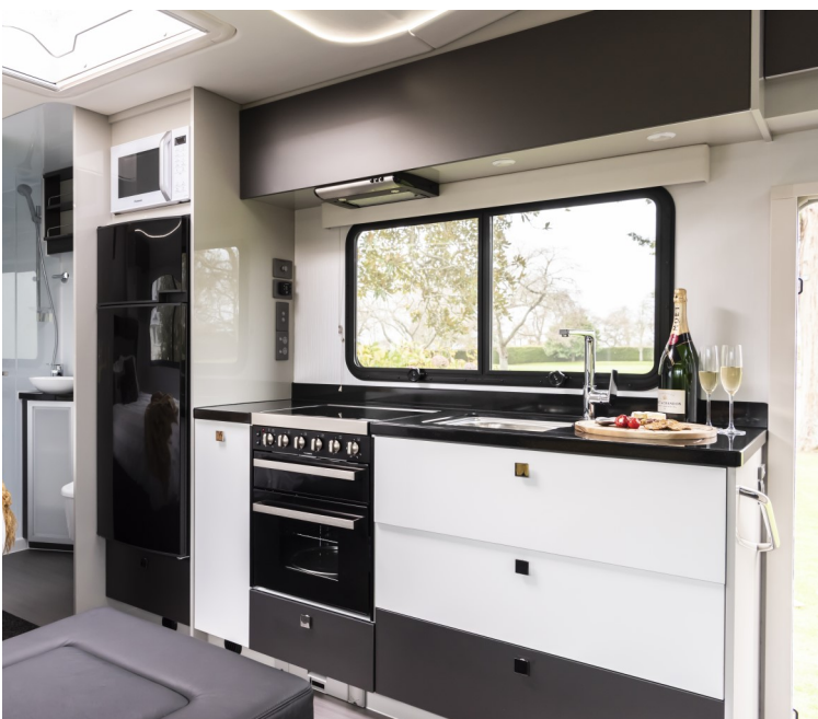
Large useable kitchen with engineered stone benchtops